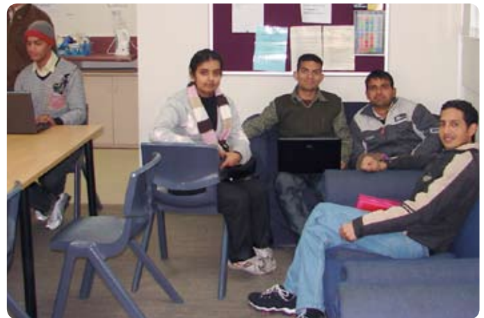
Relaxing in Student Lounge