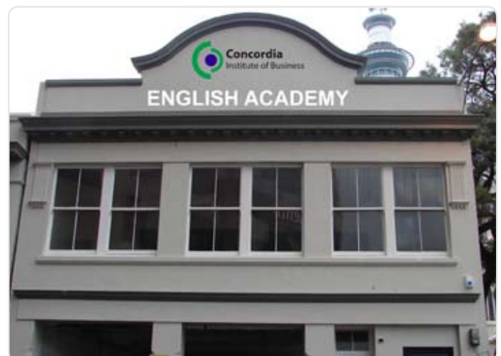
CIB English Academy Building

The General English course prepares international students for entry to University Foundation, National Certificate and Diploma courses, entry to polytechnics, and undergraduate and postgraduate university degree programmes.