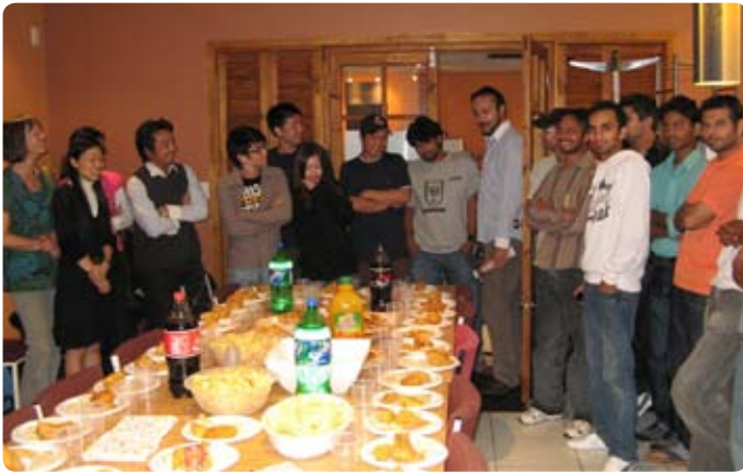
Students and staff during orientation.

Ntec recognises that many students need to find employment both for professional development and to help with living expenses. Each year several Careers Fairs are held in Auckland, and students are encouraged to attend these. Students are able to find out from the various exhibitors career choices and potential employers.