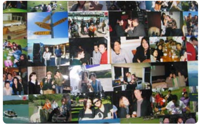
Collage of student activities