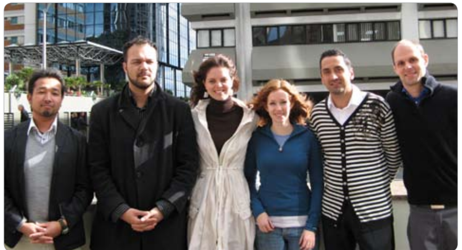
CIB English Academy staff