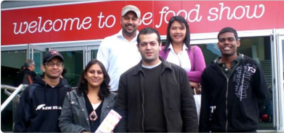
Hospitality students attending the annual Auckland Food Show.

The Hospitality Industry is one of the fastest growing areas of our economy. A career in hospitality is fun, exciting, creative, and offers worldwide employment opportunities. National Technology Institute (NTI) holds Hospitality Standards Institute (HSI) accreditation, and is approved by the New Zealand Qualifications Authority (NZQA) to deliver hospitality qualifications.