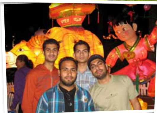
Chinese Lantern Festival, held in Auckland each year.