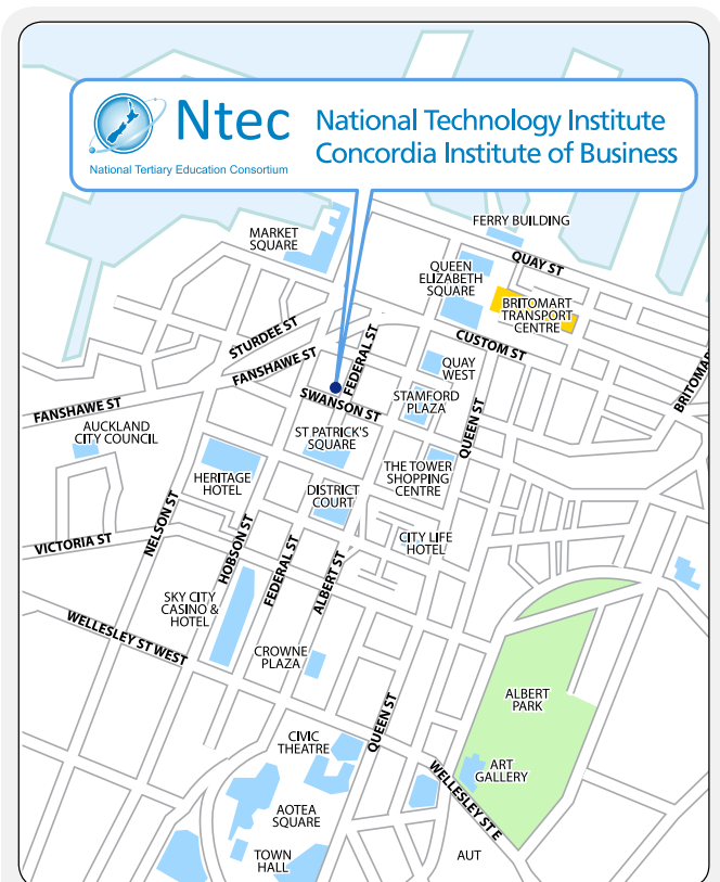
Ntec is located in the heart of Auckland, just a few minutes' walk from cafes, food courts, cinemas, shops, the Britomart train and bus station and the ferry terminal.